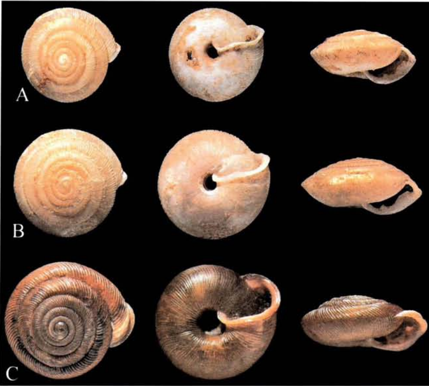
Fig. 1. A: MNIB-SHNB-2791, holotype of Oestophora cuerdai n. sp. from level D of the pleistocenic deposit at Sa Pedra Foguera (Alcúdia, Mallorca). Shell diameter: 9.66 mm; B: MNIB-SHNB-2792, Paratype of Oestophora cuerdai from the Pleistocene at Sa Calobra (Escorca, Mallorca). Shell diameter: 10.91 mm; C: Oestophora barbula from Eiras (Goián, Pontevedra). Shell diameter: 11.95 mm.

Fig. 1. A: MNIB-SHNB-2791, holotipus d' Oestophora cuerdai n. sp. Corresponent al nivell D del depòsit Pleistocènic de Sa Pedra Foguera (Alcúdia, Mallorca). Diàmetre de la closca: 9.66 mm; B: MNIB-SHNB-2792, Paratipus d' Oestophora cuerdai del Pleistocè de Sa Calobra (Escorca, Mallorca). Diàmetre de la closca: 10.91 mm; C: Oestophora barbula d'Eiras (Goián, Pontevedra). Diàmetre de la closca: 11.95 mm.